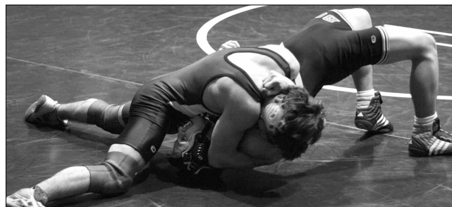
Zack Lynch • Saratoga Today